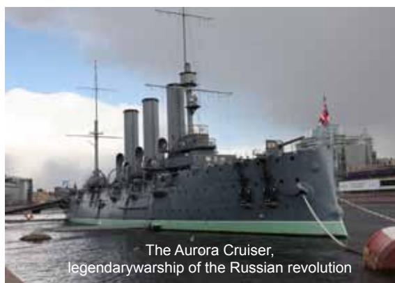
The Aurora Cruiser, legendary warship of the Russian revolution