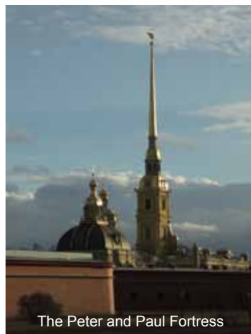
The Peter and Paul Fortress

as we found ourselves in the starting point of our tour – the Palace Square which is the heart of this magnificent city where you can physically sense the pulse of its grandiose history.