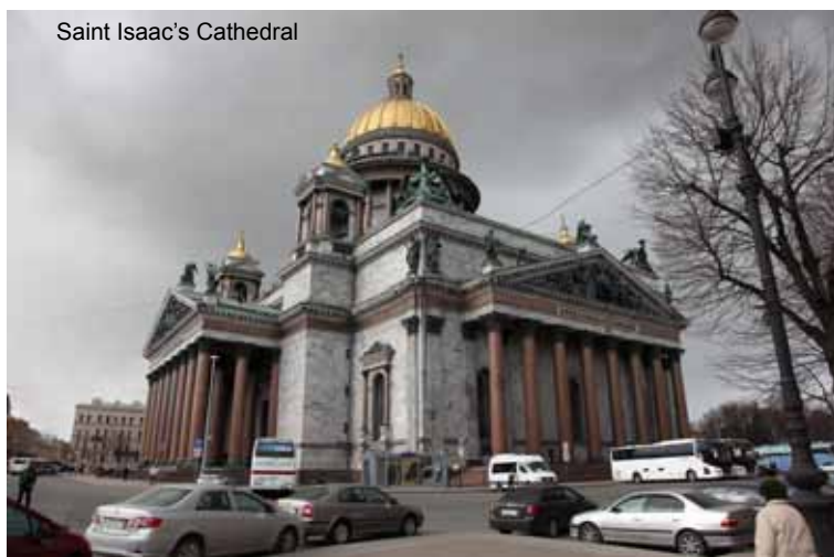
Saint Isaac's Cathedral

But how that could be possible at all to stay in St. Petersburg and lose the precious opportunity to see this great city, one of the most beautiful cities in the world? Well, yes, we were extremely pressed for time, given the aggressive schedule of training sessions. No, it is absolutely impossible to visit all essential sites in this city during brief hit-and-run tours. Yet, this was totally unthinkable to miss the opportunity to see this fantastic creation of Tzar Peter the Great and his successors.