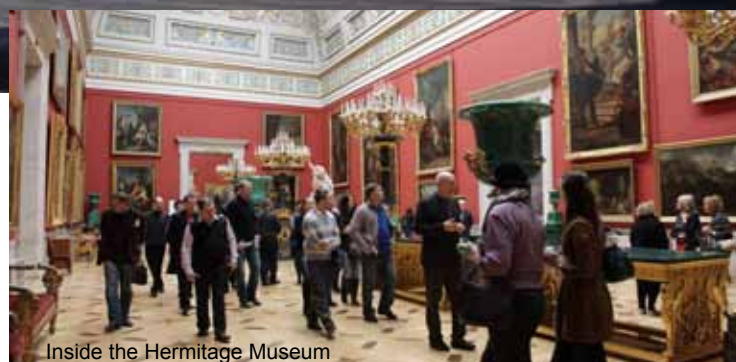
Inside the Hermitage Museum