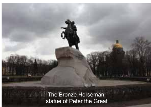
The Bronze Horseman, statue of Peter the Great

The legendary Bronze Horseman is an equestrian statue of Peter the Great in Saint Petersburg, Russia. Commissioned by Catherine the Great, it was created by the French sculptor Étienne Maurice Falconet. The name comes from an 1833 poem of the same name by Aleksander Pushkin, which is widely considered one of the most significant works of